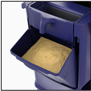
Removable trap easing the access to the absorbent