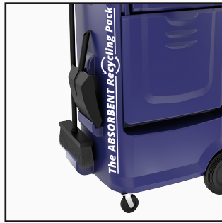
Quick access to all the tools